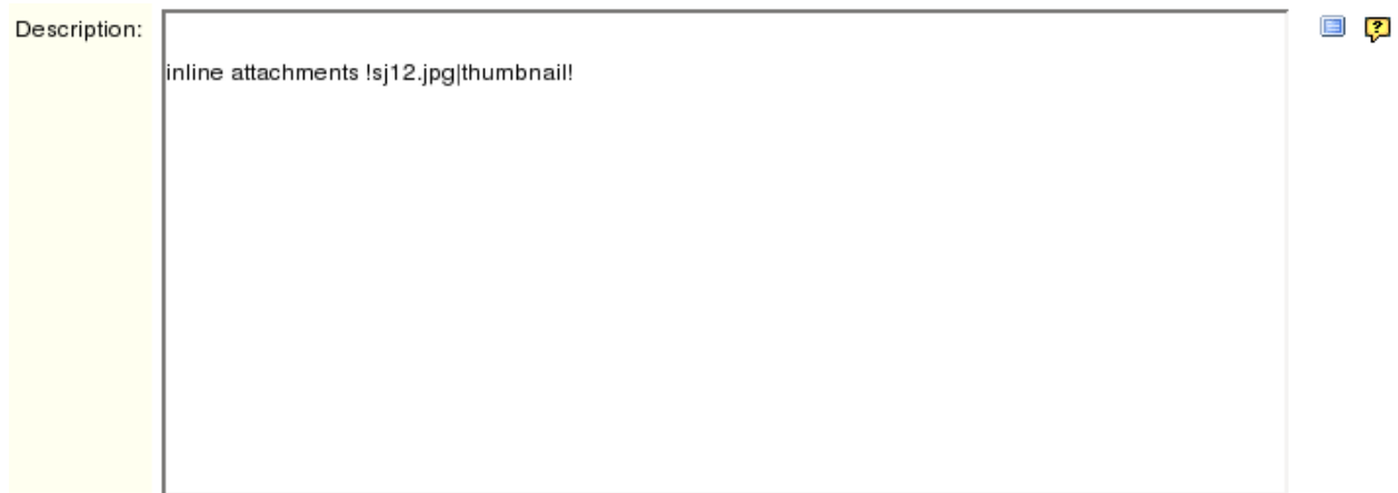
Sample of description edited with wiki renderer

For example, to include an image in the field, you would first attach the image to the issue, then type the following into the field: