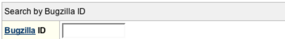
Bugzilla ID Search Portlet on Dashboard

The Bugzilla ID Search portlet should appear as follows on the dashboard: